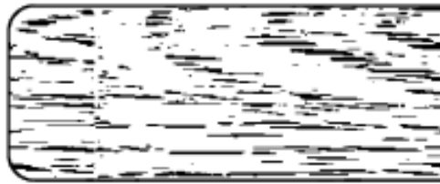
0.8125" x XX" Eased Edge K299CNC