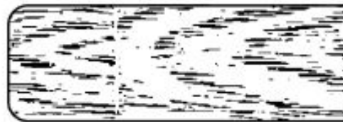
0.6875" x XX" Eased Edge K301CNC