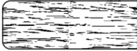
0.715" x XX" Eased Edge K298CNC