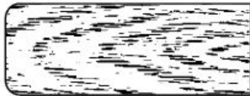
0.750" x XX" Eased Edge K300CNC